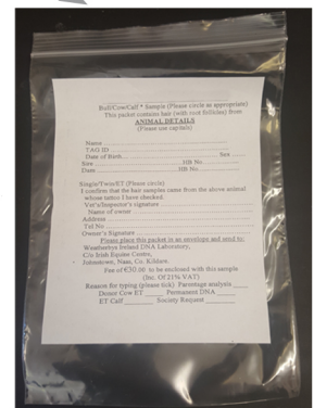
Peel back plastic cover